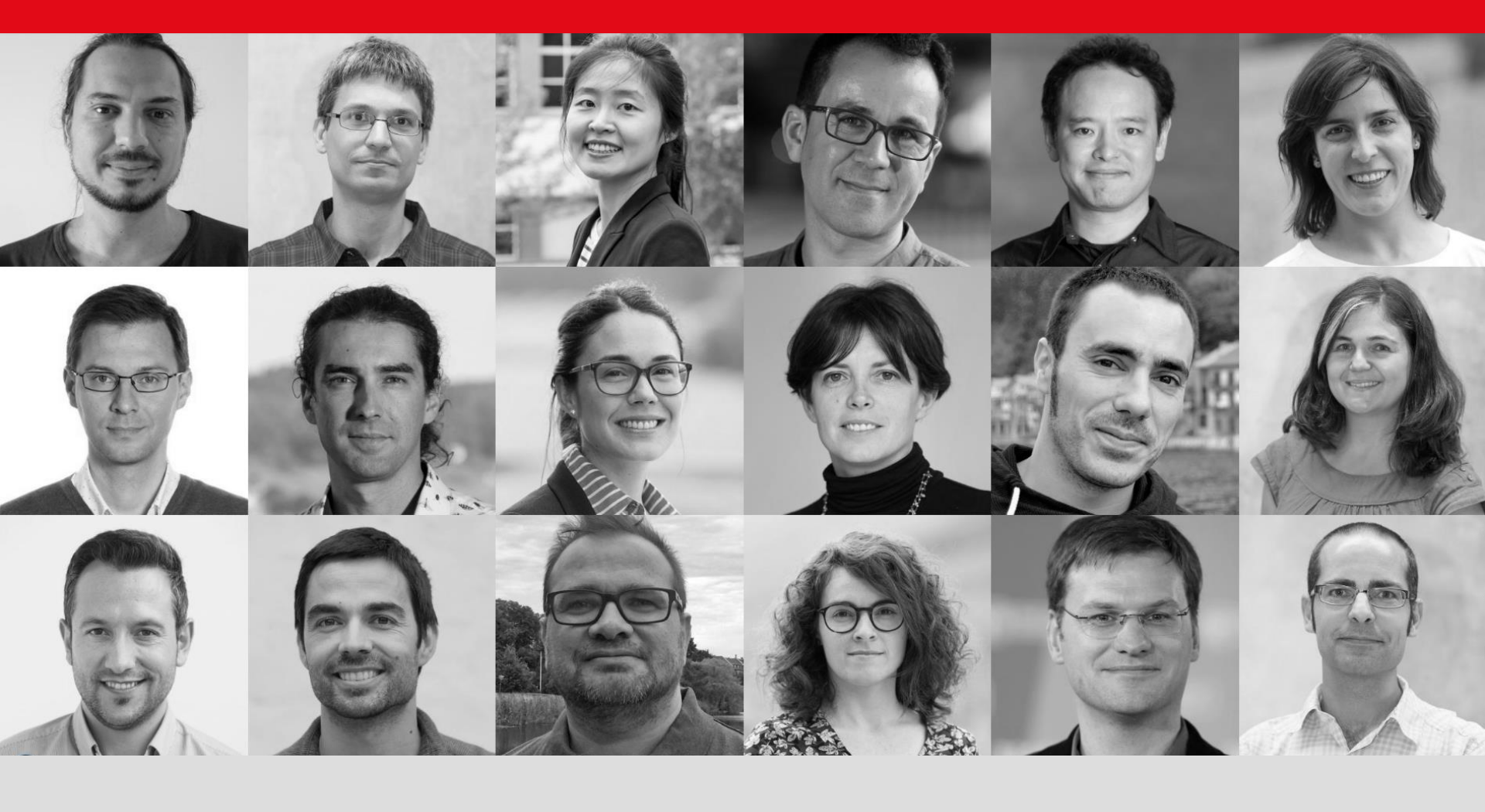
63 ikerbasque Research Fellows currently develop their research in Basque scientific institutions